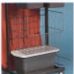
733130 Accessory Basket

Article: 733140 Wheel, 100 mm Article: 733130 Wheel w Brake, 100 mm