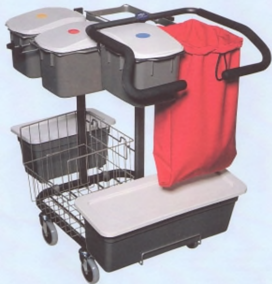
ACT® Multi-Purpose Trolley Small

The hub of The Swedish water-based cleaning concept is our Multi-Purpose Trolleys. Two things have been particularly important in the development of the trolleys: Flexibility and ergonomics. The flexibility makes it easy to equip the trolley according to whichever type of cleaning is to be done. It is also easy to adapt the trolleys to individual preferences, e.g. working height, and how the user wants to arrange the trolley equipment in order to work as effectively and as smoothly as possible.