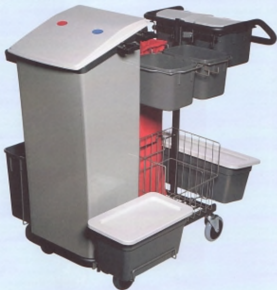
ACT® Multi-Purpose Trolley Large